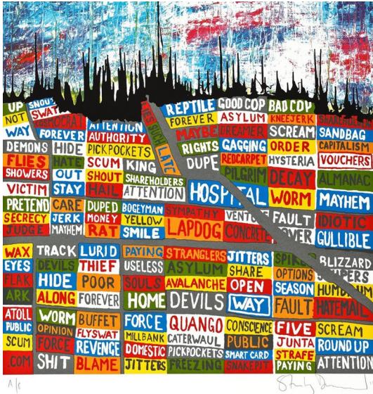
LA, 2011 by Stanley Donwood/TAG Fine Arts