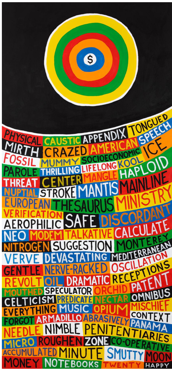
Over Normal by Stanley Donwood/www.slowlydownward.com