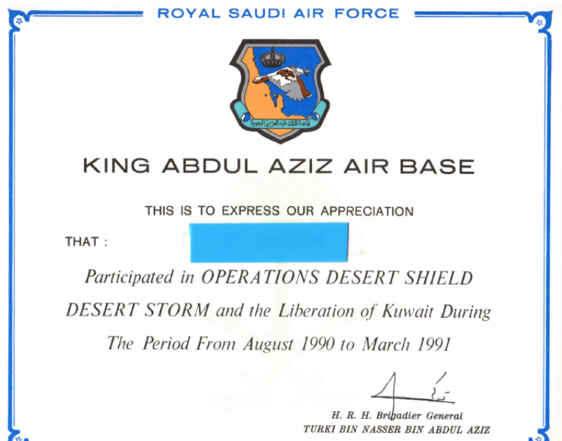
Fig. 2: RSAF Certificate of Appreciation given to military aircraft technician (UK national) employed by BAE Systems, Dhahran, 1991 (name withheld) 59

BAE Systems' attitude to the frontline involvement of its employees with RSAF combat aircraft appears to have tightened during subsequent conflicts in which the UK itself has not directly participated. In November 2009, RSAF began airstrikes in the Sa'dah governorate of northern Yemen following fighting between Yemeni, Saudi and Houthi forces near the Yemeni-Saudi border. An expatriate Tornado armourer working at a Saudi air base at that time described undertaking armouring tasks for aircraft engaged in Yemeni operations at the start of the 2009 engagement, and then being "pulled back" into an advisory role by his managers. He insisted, though, that he was still expected to be present during some ground support activities and to undertake maintenance on the aircraft engaged in Yemen, thereby continuing the blurring of advisory and operational roles: